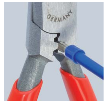
Crimping 0.5 to 2.5 mm 2